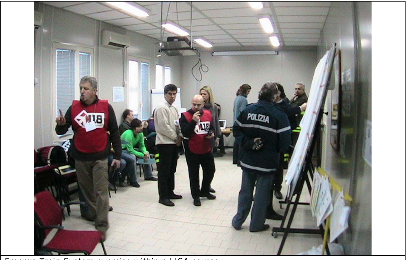
Emergo Train System exercise within a LISA course

Emergo Train System methodology has been used within a regional joint training program addressed to ambulance teams, Police, Fire Brigade and Highway personnel (L.I.S.A. = Guidelines for dealing with Medical Rescue on Highways) in order to reduce the risk of fatal injuries on the l'Emilia-Romagna highways network.